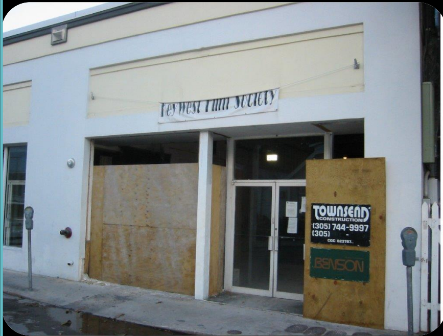
Tropic Cinema circa. 2002